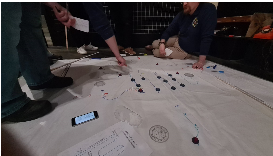
ADJUDICATION OF TORPEDO ATTACK IN TURN 3

Contact was gained ! U-boats were attacked. But not before those rotters had fired off a spread of torpedoes each, with devastating consequences for Britain's supply lines.